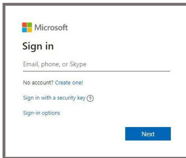
Figure 1: Login Screen